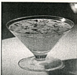
D'S CILANTRO MARTINI By Andú

3 oz. Bombay Sapphire Gin or Belvedere Vodka